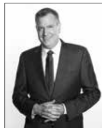
Andrew M. Cuomo