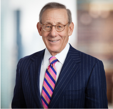
STEPHEN M. ROSS